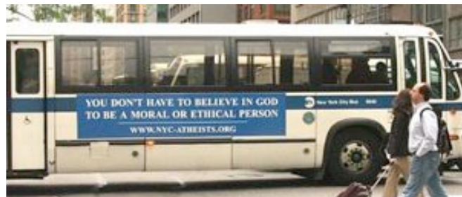
NYCA BUS POSTER

CBS, NBC, CNN, FOX, ABC, WPIX, MSNBC, NY Times, Daily News, NY Post, Village Voice, AM-NY, METRO, Independent News, Independent Film Producers.