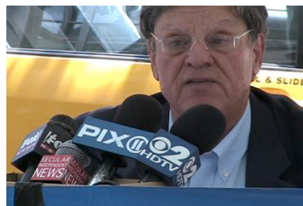
BUS PRESS CONFERENCE

CBS, NBC, CNN, FOX, ABC, WPIX, MSNBC, NY Times, Daily News, NY Post, Village Voice, AM-NY, METRO, Independent News, Independent Film Producers.