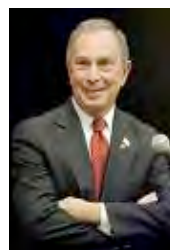
Mayor Michael Bloomberg